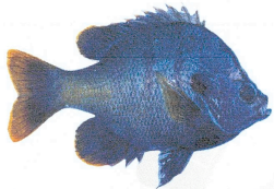
Coppernose Bluegill 1-3" $55 per 100