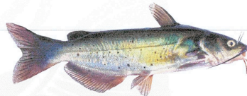
Channel Catfish 3-5" $65 per 100