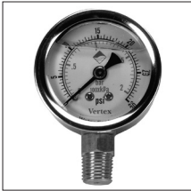
A Liquid Filled Pressure Gauge

The representative photos below and charts on the following pages match the parts sticker found on the back of the Owner's Manual that shipped with the compressor cabinet. If you no longer have the Owner's Manual, look on the silver ETL sticker inside the cabinet for the Warranty Code to look up your system.