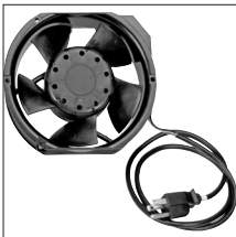
I Compressor Fan