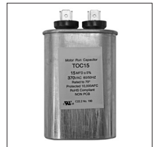
H Capacitor 230v