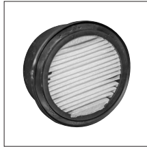
B Replacement Filter