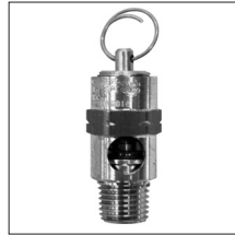
C Pressure Relief Valve