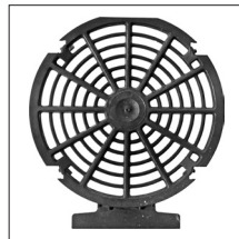
G Compressor Fan Guard