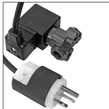
J Solenoid Valve