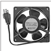
E Cooling Fan