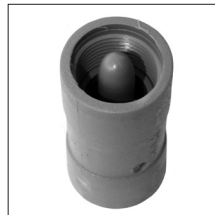
K Check Valve